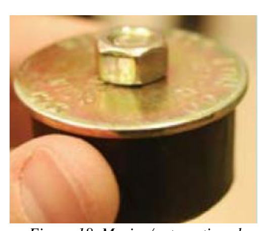
Figure 18. Marine/automotive plug.