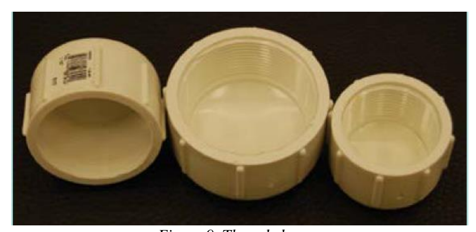
Figure 9. Threaded caps.

The plumbing fixture is removed, and the correct size threaded cap is installed on the pipe. (Figure 9)