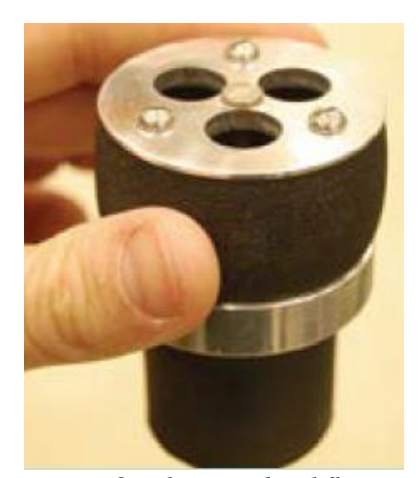
Figure 6. Floating backflow valve. Figure 7. Floating backflow valve.