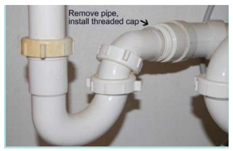
Figure 16. P trap under sink.