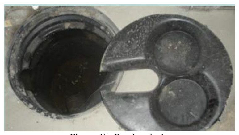
Figure 19. Footing drain.

A potential area for problems and leaking could be backflow from the sewer pipe collecting water from the footing drain. Some older homes have footing drains that lead to the sewer system. ( Figure 19 )