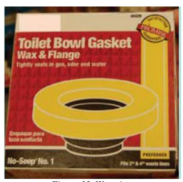
Figure 13. Wax ring.