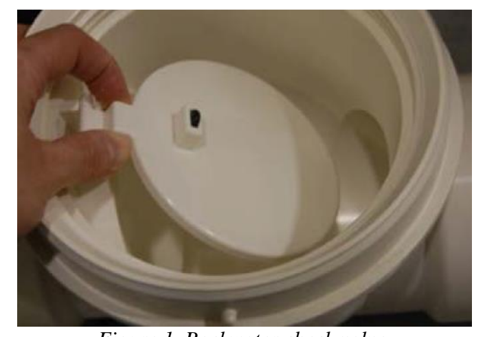
Figure 1. Backwater check valve.

Occasionally, slice or knife valves are installed in homes. The valves generally are accessed through a holdout in the basement floor and can be turned off and on easily in the event of flooding or sewage backup. Once closed, a slice valve will not allow sewage flow in either direction, so toilets and water cannot be used in the home. (Figure 2)