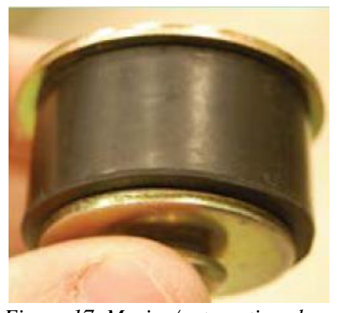
Figure 17. Marine/automotive plug.

To plug the overflow, remove the overflow cover and install a properly sized drain plug. You may need to purchase an automotive or marine plug since the overflow drain is shallow. (Figure 17, 18)