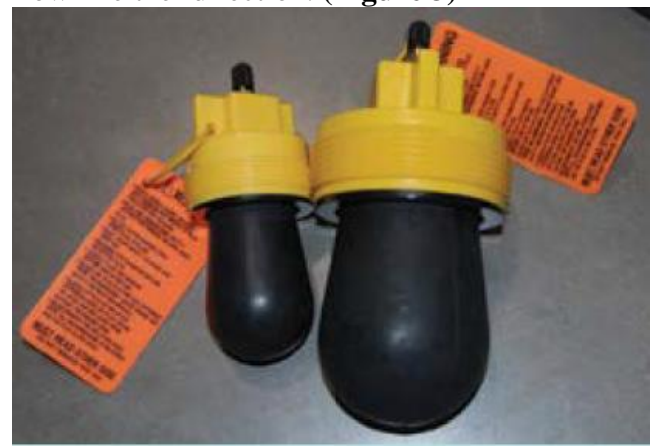
Figure 3. Test ball.

Test balls conventionally are used for pressure testing plumbing systems but can be used in emergency situations to seal drains. The ball is inserted into the pipe and inflated with air to the prescribed air pressure. Once inflated, the ball will not allow water to flow in either direction. ( Figure 3 )