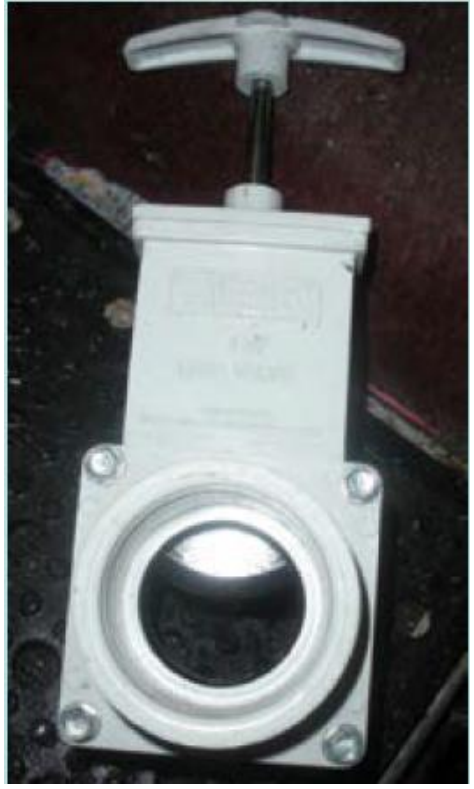
Figure 2. Knife valve.

A backwater valve can be installed in an existing home. Have a licensed contractor install an interior or exterior backwater check valve in your sewage system. If you do not have a backwater valve, plugs with backflow devices can be installed in floor drains. These plugs have a ball or float that will stop water or sewage from backing up into a home while permitting water to flow into the drain. These plugs can be left in place year-round.