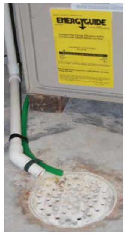
Figure 10. Floor drain.

Test balls, twist plugs or pressure plugs can be installed to seal floor drains but will not let water flow in either direction. If plugs are not available, a flexible rubber ball that is just larger than the pipe diameter can be used in an emergency but will need to be braced in place.