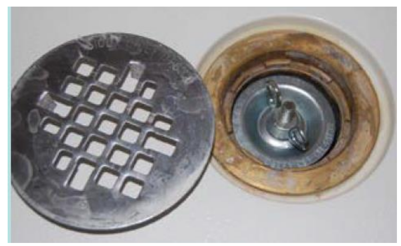
Figure 14. Plugging shower drain.

Shower drains come in a variety of types and sizes, so plugging them depends on the specific type. If the shower drain grate can be removed, simply place a proper sized drain plug into the drainpipe and tighten until snug. Some shower drain grates are not removed easily, so the drain needs to be covered with a material that will prevent sewage from leaking in if a backup occurs. These drains can be covered as described above with a thick piece of rubber or inner tube and then secured with a board or plywood. The seal needs to be held in place using the method described for bracing floor drain seals. ( Figure 14 )