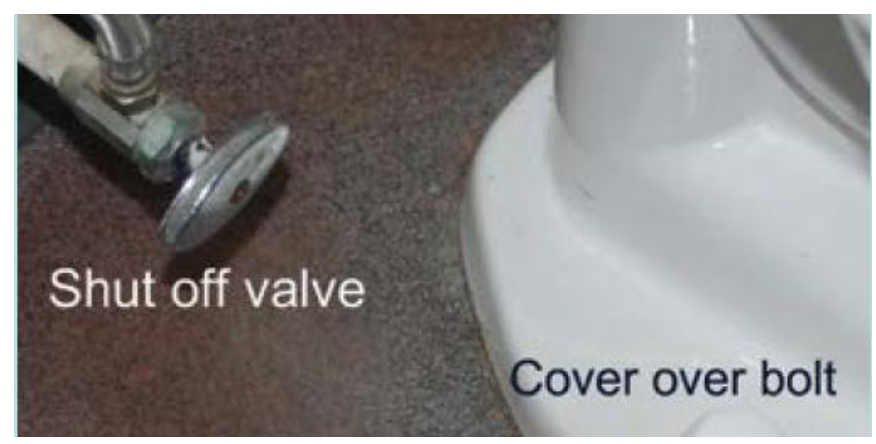
Figure 12. Toilet.

Basement toilets in potential flooding areas should be removed and the drainpipe should be plugged. Follow these steps to plug toilet drains: ( Figure 12 )