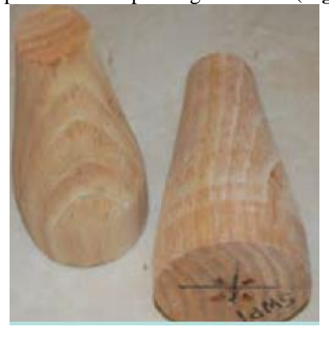
Figure 5. Pressure plug.

Conical-shaped rubber or wooden plugs can be used to plug drains. These plugs will be smaller in diameter than the pipe to be plugged on one end and larger than the pipe on the other end. The plugs are forced into the pipe and may need to be braced to prevent pressure from pushing them out. ( Figure 5 )