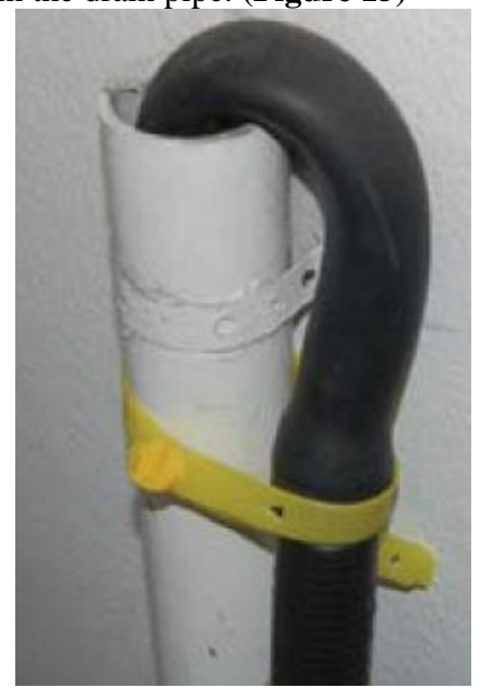
Figure 15. Washing machine drain hose.

Washing machine drains can be plugged by removing the washing machine drain hose from the drainpipe and then placing the correct diameter plug in the drain pipe. ( Figure 15 )